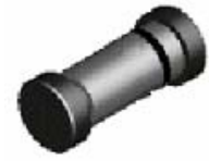
SURFACE MOUNT LL34