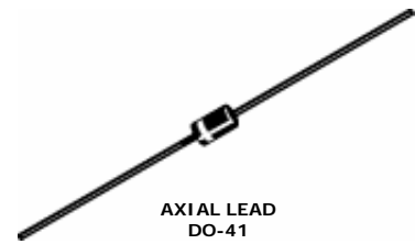
AXIAL LEAD DO-41